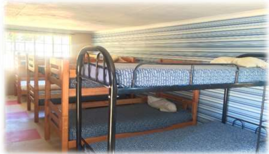
Figure 3 New Jerusalem Children's Home current Boys residential dorm bed setup