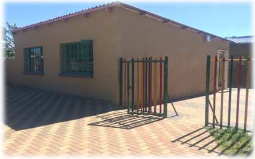
Figure 2 Current New Jerusalem Children's Home boys residential unit_ outside view

Phina's dorm , area where boys are currently sheltered and sleeping is the old double garage, part of our drive in the organisation is to recycle the buildings and give them a secondary use and avoid demolishing them, which was converted to address the need of time, sheltering and providing a roof over the children head.